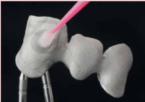
SHOFU MZ Primer Plus