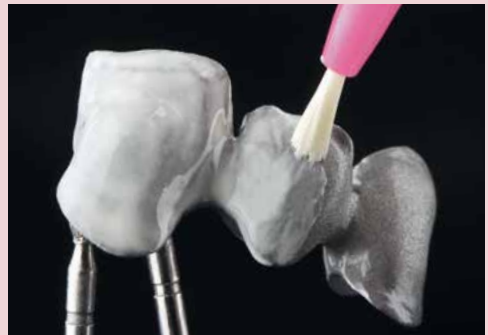
SHOFU Universal Pre-Opaque