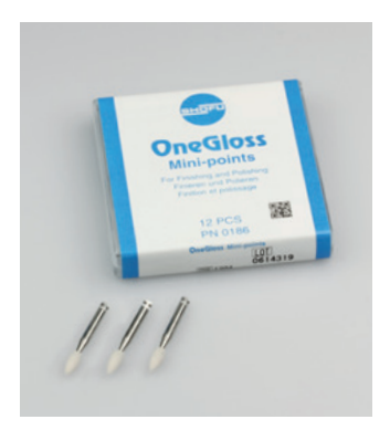
Shape: Minipoint PN 0186