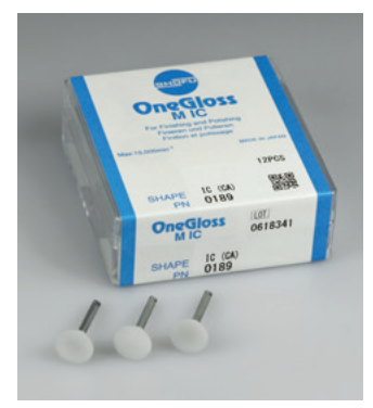
Shape: IC PN 0189