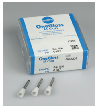
Shape: Cup PN 0187