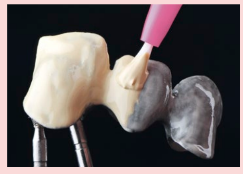
SHOFU Universal Opaque

SHOFU Universal Primer, the successor to the proven SHOFU MZ Primer Plus, is the universal solution for bonding resins to CAD/CAM metal and zirconia frameworks, thanks to its wide range of indications and quick and easy handling without any further accessories or heat treatments.