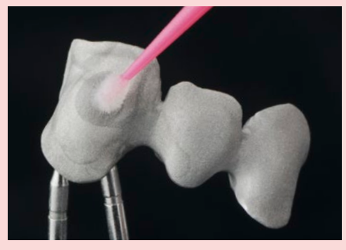
SHOFU Universal Primer