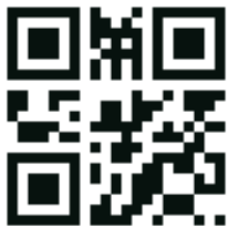
QR code to activate the cross polarization mode

Scan the QR code below to activate the cross polarization mode. When the message "Change the optional setting?" appears, press "OK".