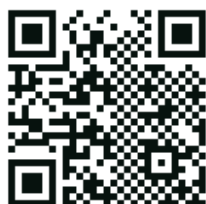
QR code to save as a custom mode

Scan the QR code below to save the cross polarization mode as a custom mode. When the message "Select the number" appears, select one of the three custom settings. Thereby make sure the camera is in a shooting mode (one of the 9 preinstalled modes), since QR codes cannot be scanned in the custom mode.