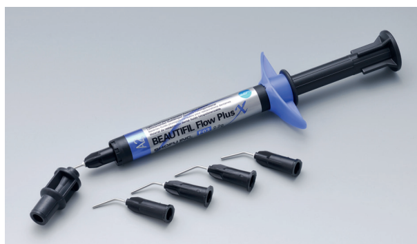
F03 – moderate flow (Low Flow)