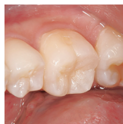
Occlusal morphology after filling