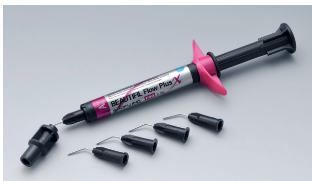
F00 – absolutely stable (Zero Flow)