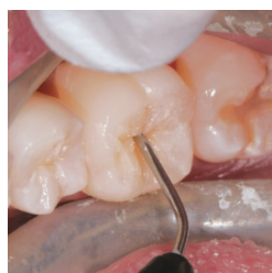
Build-up of cusp ridges with F00