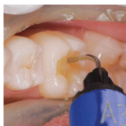
Cavity lining with F03