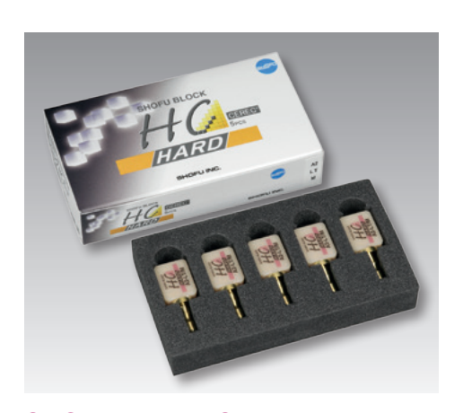
SHOFU Block HC Hard 5 pieces each